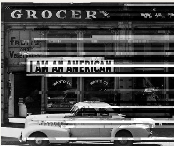
'I am an American' Oakland, Calif., Mar. 1942. Photographic print. 1942.

A large sign reading "I am an American" placed in the window of a store, at 13th and Franklin streets, on December 8, the day after Pearl Harbor. The store was closed following orders to persons of Japanese descent to evacuate from certain West Coast areas. The owner, a University of California graduate, confined with hundreds of evacuees in War Relocation Authority centers for the duration of the war.