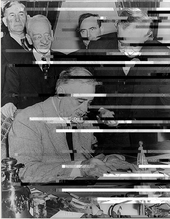
'President Roosevelt signing the declaration of war against Germany' Dec. 11, 1941